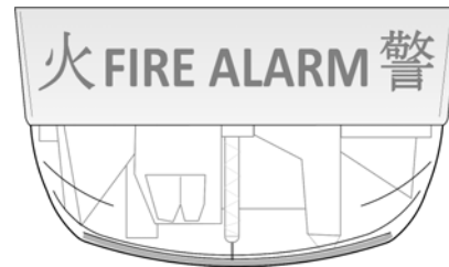
Ceiling Mount Addressable V/O with Chinese/English Lettering

provide convenient installation to standard electrical boxes. The strobe is individually addressed and individually controlled with power, supervision, and control supplied from a Simplex fire alarm control panel providing IDNAC Signaling Line Circuits (SLCs). (See compatibility list on page 3.)