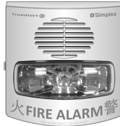
TrueAlert ES Addressable A/V, White with Red Lettering