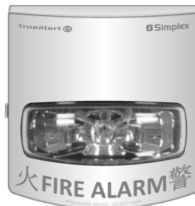
TrueAlert ES Addressable Strobe, White with Red Lettering