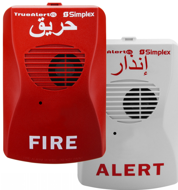
TrueAlert ES 59AO series Addressable Horns are Available in Red with White Lettering and White with Red Lettering