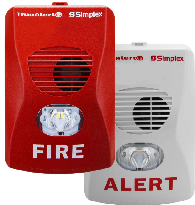
Figure 1: TrueAlert ES 59AV LED Addressable A/Vs are Available in Red with White Lettering and White with Red Lettering